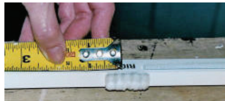
Figure 5. Transfer this measurement from the middle of the pile to...