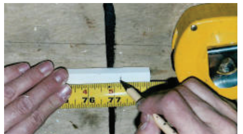
Figure 8. Mark and cut the bottom.