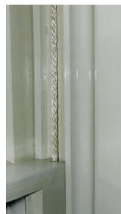
Figure 21. You are now finished with the installation.

Want to find out more? Do you have additional questions?