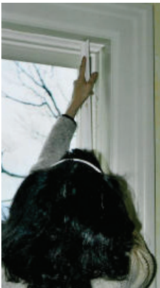
Figure 19. Install lower sash and interior stop.