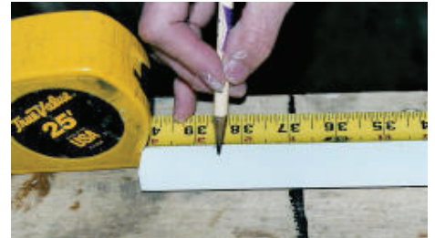
Figure 6. ...the top of Easy-Stop. Cut at the mark.