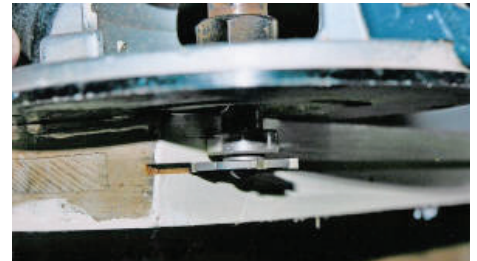
Figure 15. For the lower sash, cut 1/8" by 3/8" kerf on the bottom. This is where the silicon flap will go.