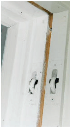
Figure 1. Begin by removing all existing parting-stops. (Aka parting-bead)