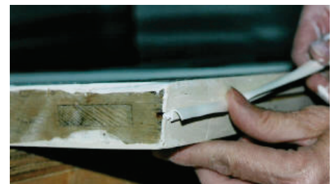
Figure 17. Install silicon flap on bottom.