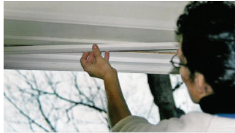
Figure 3. Cut and fit Easy-Stop head piece. Pile faces outwards.