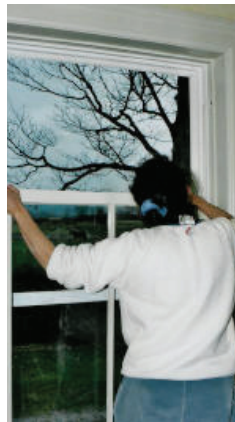
Figure 12. Attach ropes and install upper sash.