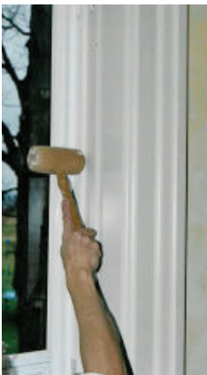
Figure 10. Install right side