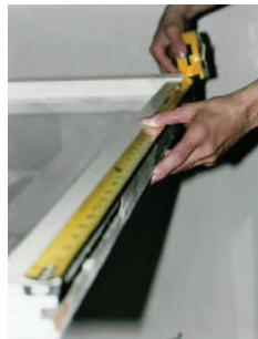
Figure 4. Measure the height of the upper sash.