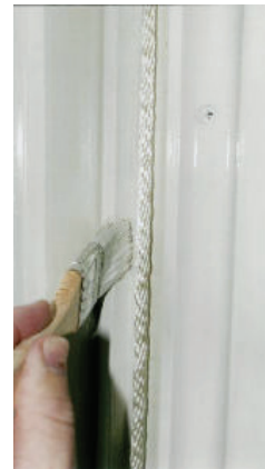
Figure 20. Complete paint and any touch-ups.