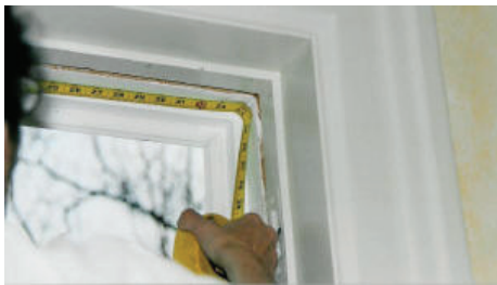
Figure 2. Measure for upper piece (42" stop)