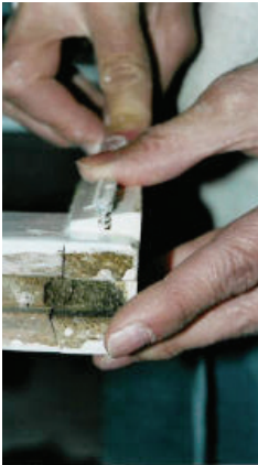
Figure 18. Install barbed-pile at meeting rail.