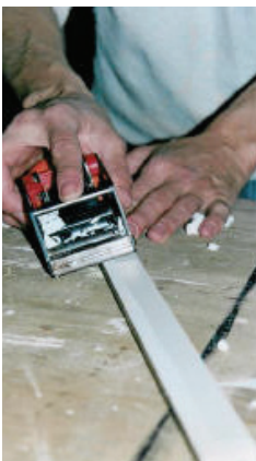
Figure 11. If necessary, plane for a snug fit. If loose, glue or nail in place.